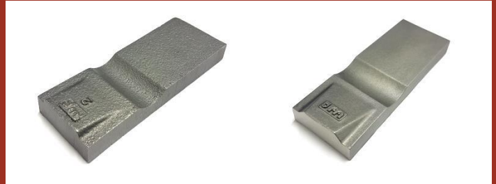
Sand Casting (new)