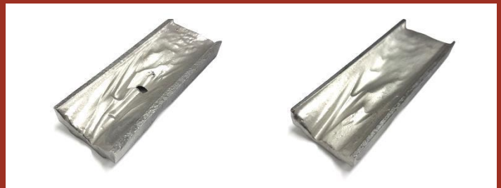
Sand Casting (end of life)